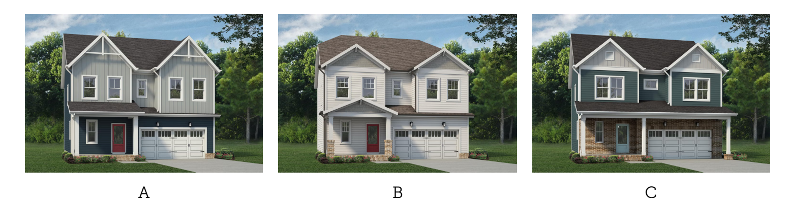
All square footage is approximate. Renderings are artist's conceptions and may vary slightly from the actual home. Homes may be built in reverse of plans shown, depending on site conditions. Minor architectural changes may be made occasionally at the option of the builder. Please contact your Sales Consultant for details.

This plan proves that nobody puts baby in the corner. The smallest of the bunch packs in a ton of happiness and other life necessities. It starts with a pocket office you don't have to use as an office. Use it for whatever makes you happy - eating, working, playing, relaxing - and leads into the very open family room, breakfast nook and kitchen. You'll smile about having the largest master suite in the collection, two additional bedrooms and a large loft upstairs, all while enjoying the endless amenities of Wendell Falls.